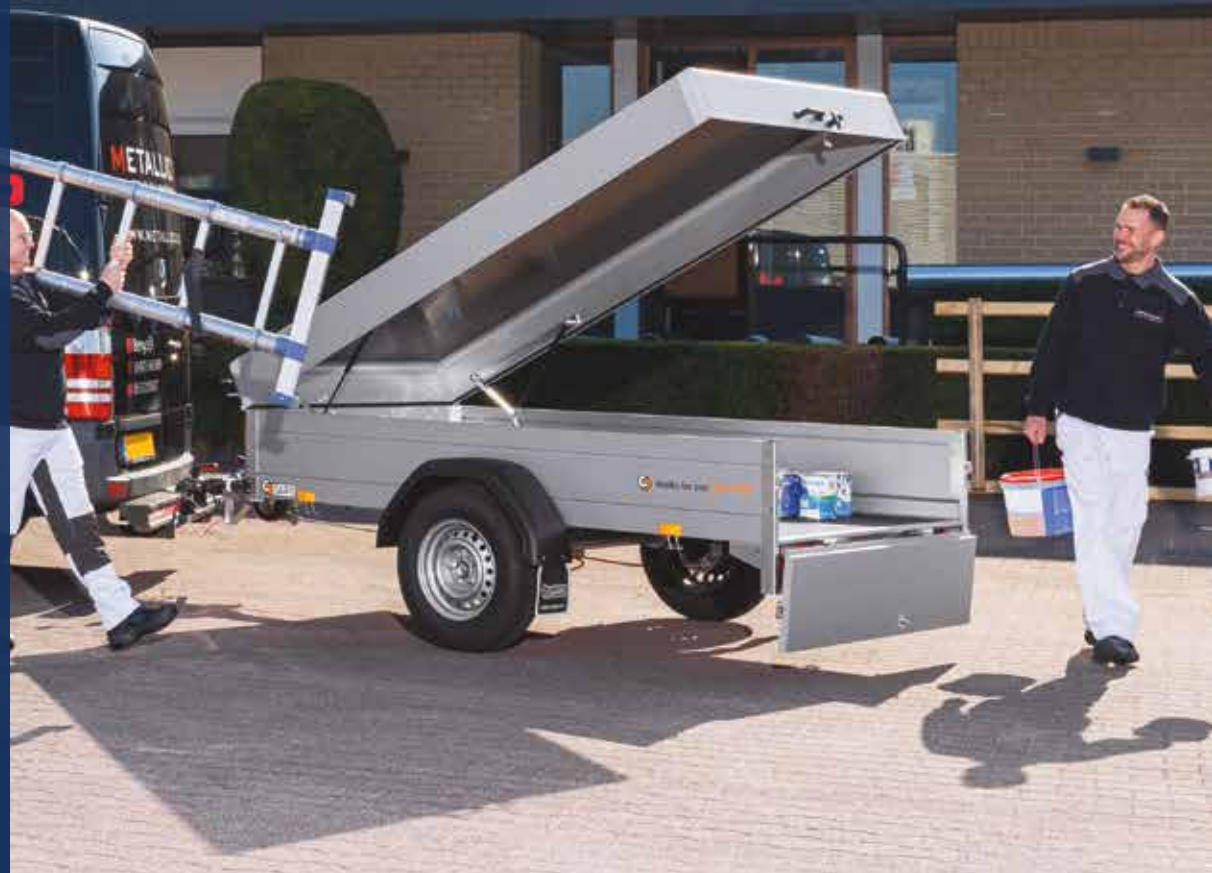
SARIS McAlu Comfort MC 255 133 1350 1

Our luggage trailers are available with brakes and without brakes, are properly lockable and splash-waterproof. This also makes the SARIS luggage trailer very suitable for a handyman/painter as an alternative to a Van Body. Optionally, the SARIS McAlu Comfort with a lid is available with black roofbars that can carry a load of up to 75 kg